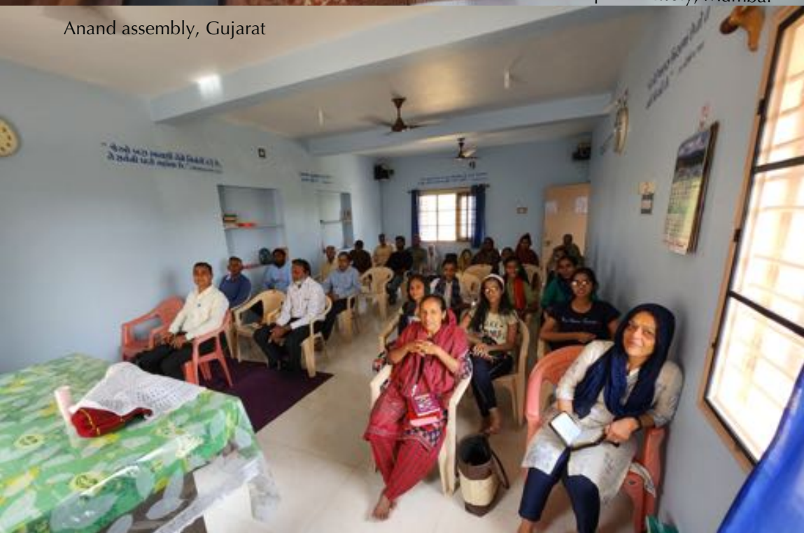
Anand assembly, Gujarat