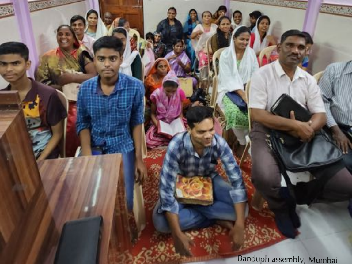
Banduph assembly, Mumbai