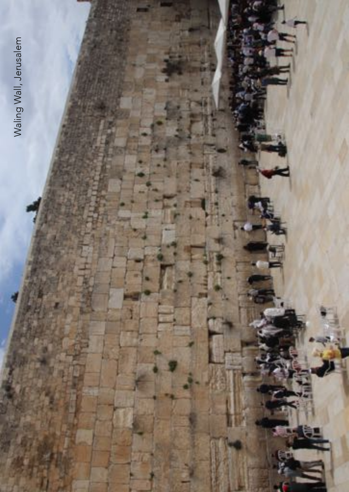
Wailing Wall, Jerusalem