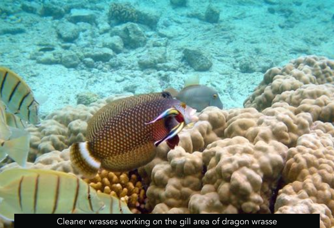
Cleaner wrasses working on the gill area of dragon wrasse