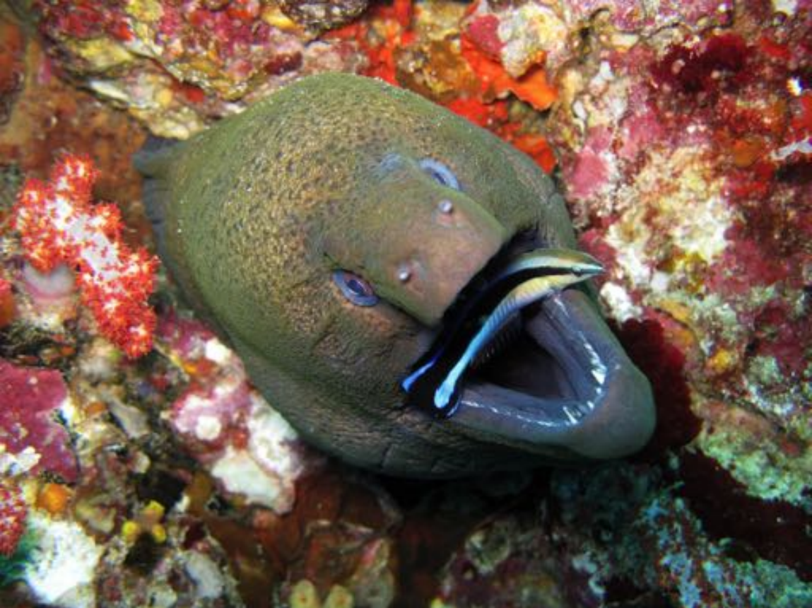
Cleaner wrasse with a client moray eel

The wrasse has distinct blue colour and black stripe which is recognised by the client fish. The wrasse perform a coordinated dance to attract clients who when they arrive adopt a specific pose indicating they are ready to be cleaned.