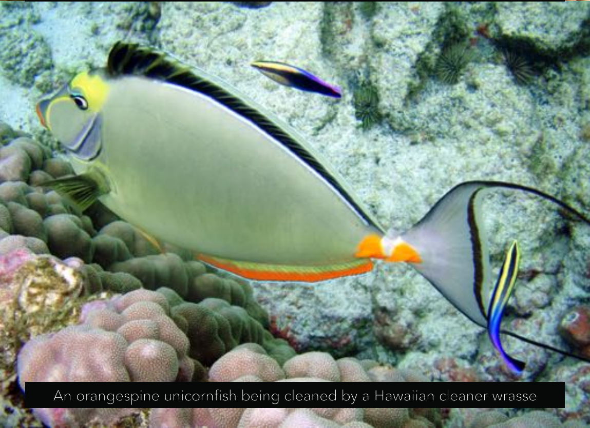
An orangespine unicornfish being cleaned by a Hawaiian cleaner wrasse