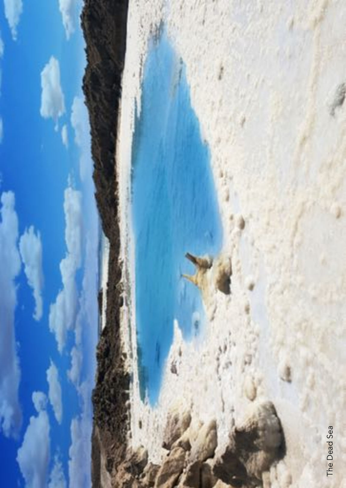
The Dead Sea