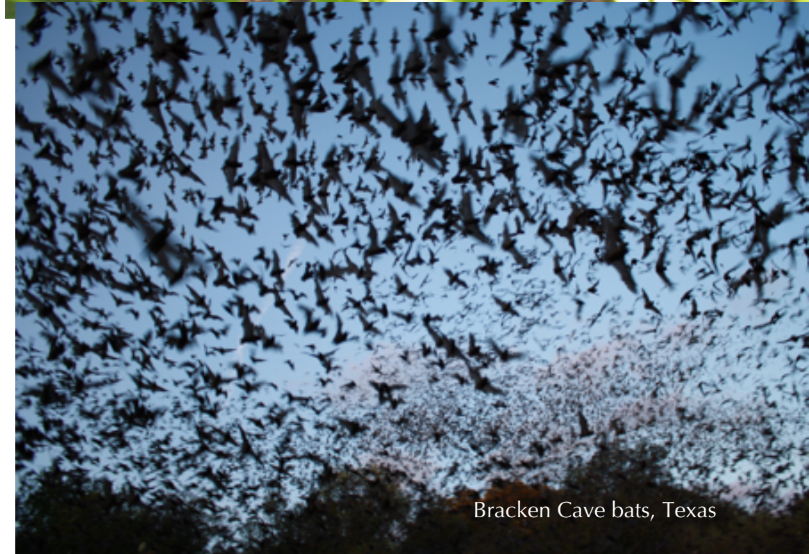
Bracken Cave bats, Texas