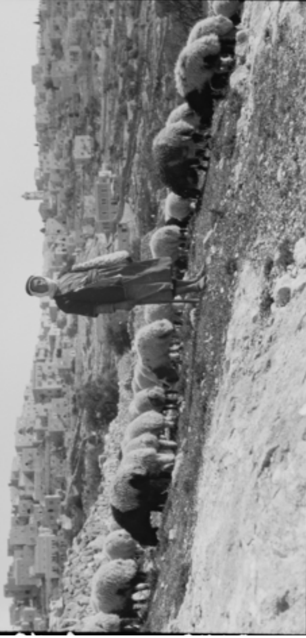
Bethlehem Shepherd (1920,)