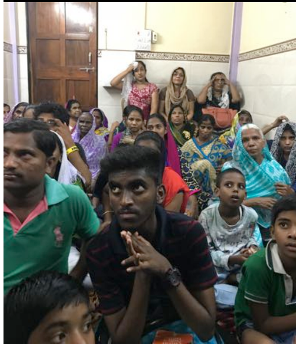
Assembly in the Banduph slum (Mumbai)