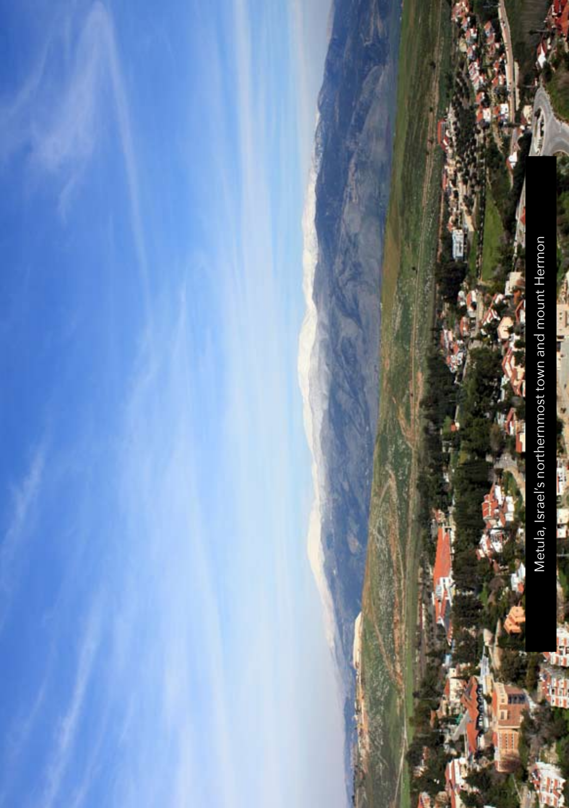
Metula, Israel's northernmost town and mount Hermon