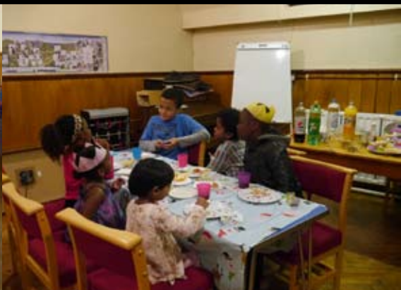
Seekers Christmas party & Watchnight service (below)