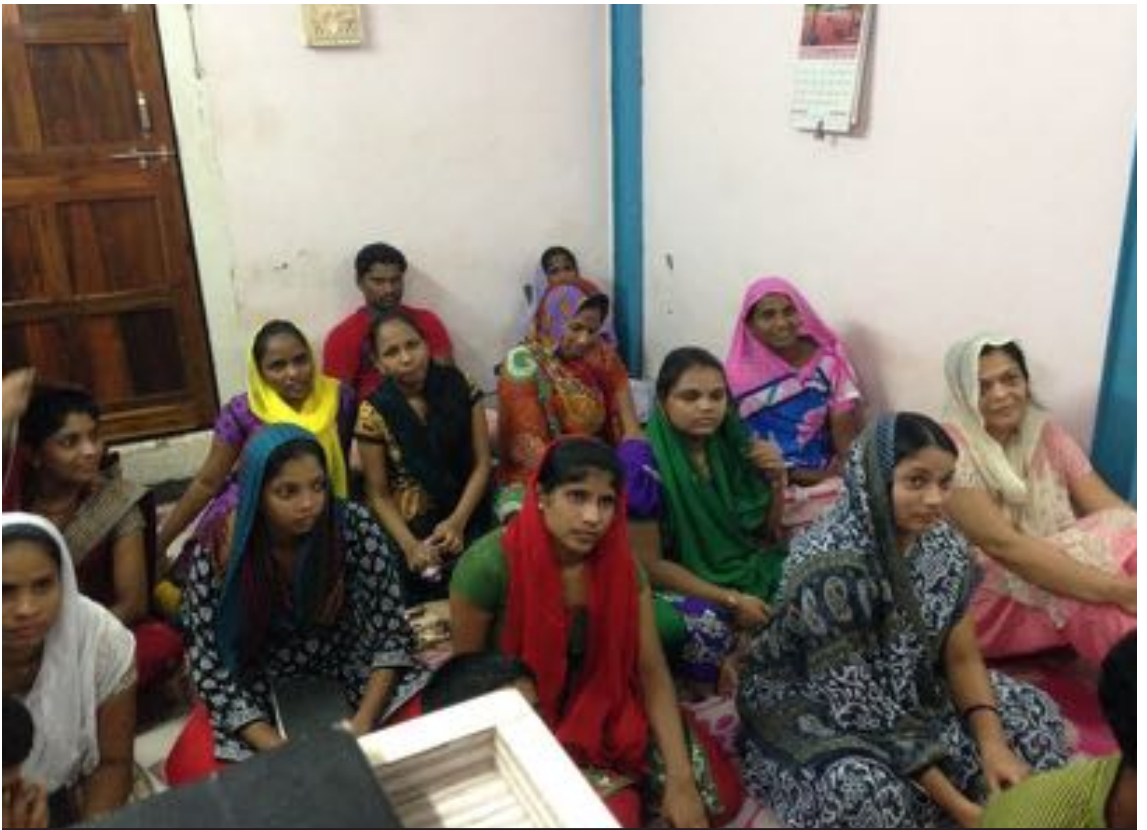
Assembly in Banduph slum (above) and assembly in Anand Gujarat (below)