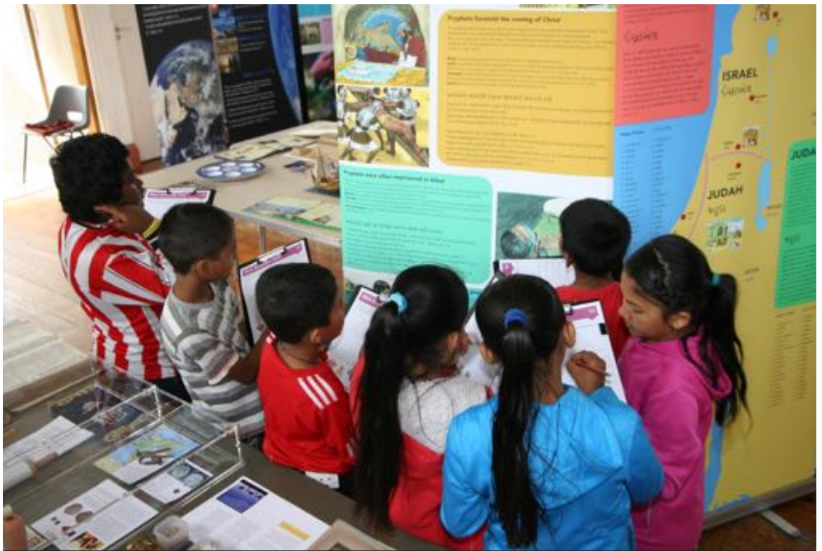
Wembley Bible Exhibition & Children's Special Christmas party & Prize giving