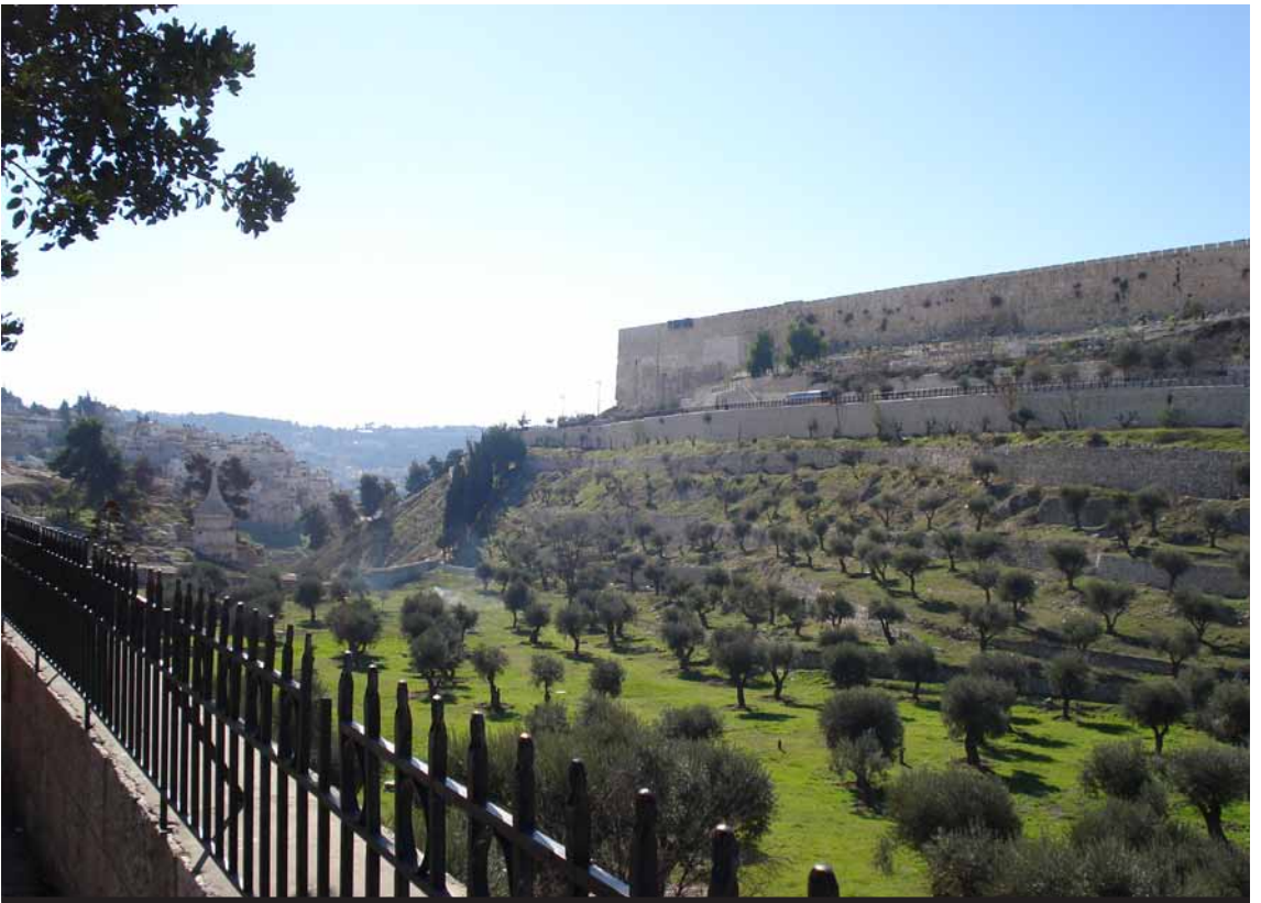
The Kidron Valley, Jerusalem (Above) The East Gate, Jerusalem (Below)