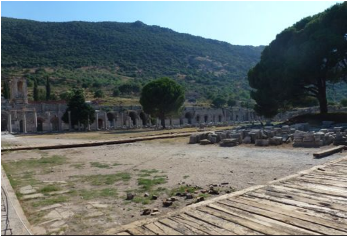
Market place in ancient Ephesus where Paul preached Christ & below the Celsus library in Ephesus (built 135 AD)