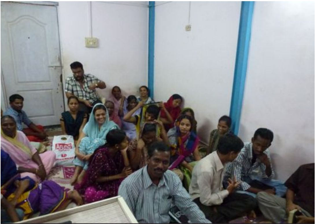
Assembly in Banduph & gospel meeting in Anand (below)