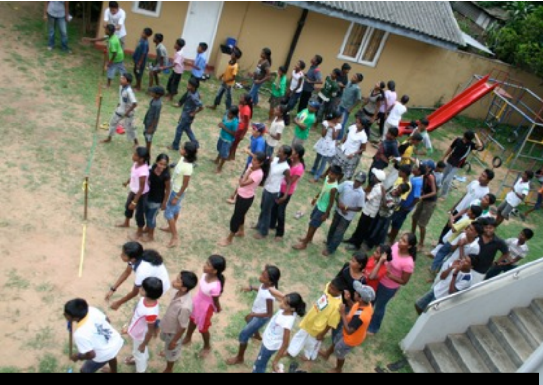
Young people at Bethesda Colombo