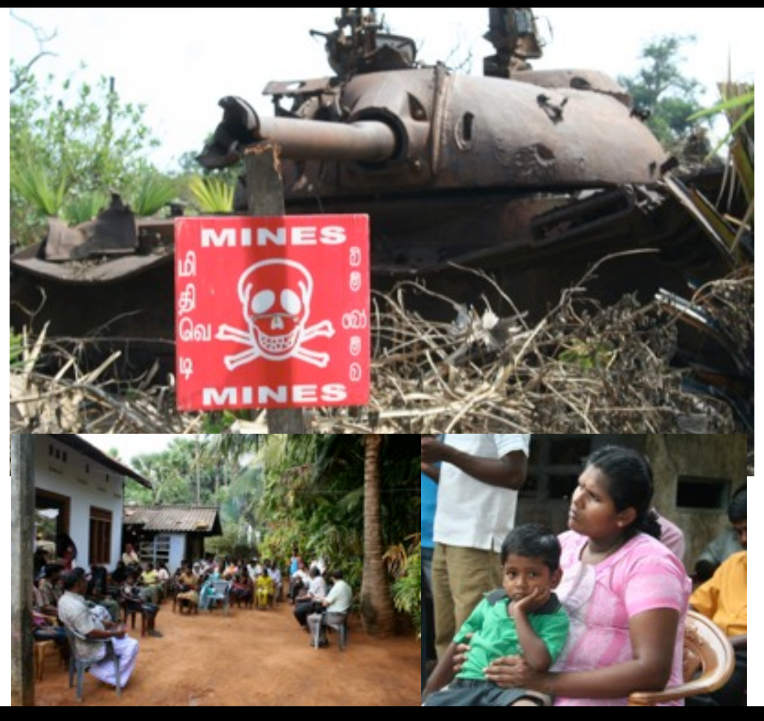
Gospel meeting in village near Jaffna